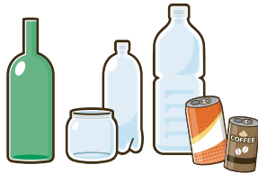
Bin, Can, Plastic bottle etc